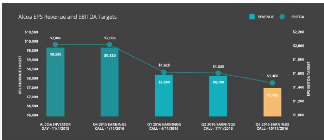
Source: Alcoa investor presentations. Inclusive of TCS business segment

We believe that Arconic also has a history of poor communication with investors and broken promises. Arconic’s largest and most valuable business, Engineered Products & Solutions (EPS), substantially missed both the original performance targets that management set for 2016 – at the 2015 Investor Day (November 2015) – and the subsequently revised-down targets set on the Q1 Earnings Call (April 2016).